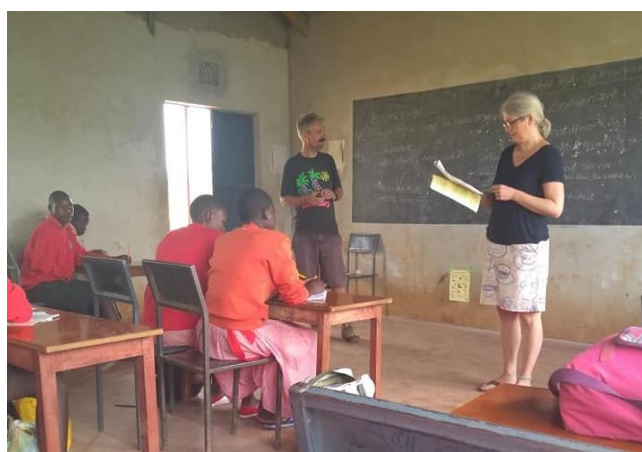
Figure 13: Business Training

Linked to this, Uzima Children Orphan Centre is planning to make contact with 5 Talents ( www.fivetaleants.org.uk ), which is a simple way people can join together in developing countries and borrow a bit of capital to set up their own business.