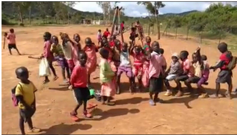
Figure 21: The Seesaw is in good use...

The much-used play equipment (see photo) at the centre needed repair. Uzima In Our Hand has send money to repair them, which has happened in the mean while.