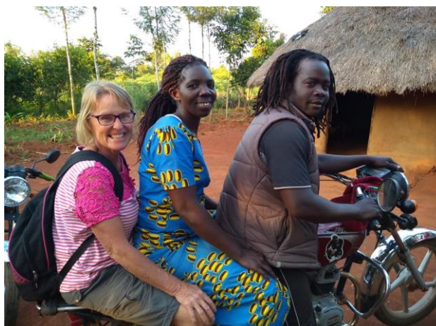
Figure 16: Local transport