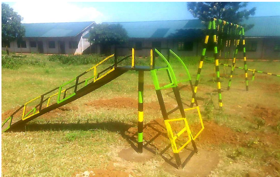
Figure 20: New play equipment