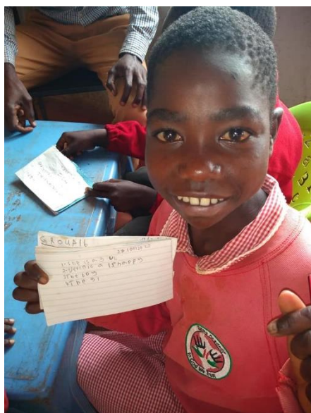
Figure 12: Special Needs Classes

The grievance policy, which was implemented last year, has now been signed by all staff, and the Roles and Responsibility document has clearly improved the organisation at the school.