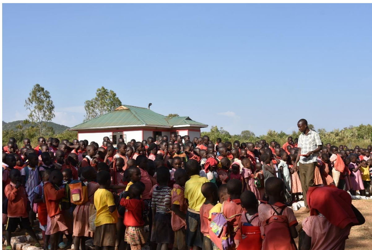
Figure 1: 'Uzima Children Orphan Centre' in the Samia district of Western Kenya

This is an INTERIM report. Uzima In Our Hands has decided to align its financial year with Uzima Children Orphan Centre, which runs per calendar year. For that reason, this year's financial year will run from 1 August 2019 – 31 December 2020. To ensure we can inform our supporter community, the trustees have agreed to make this interim report available. Please note this report has not been audited.