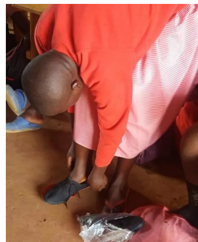
Figure 19: New Shoes!