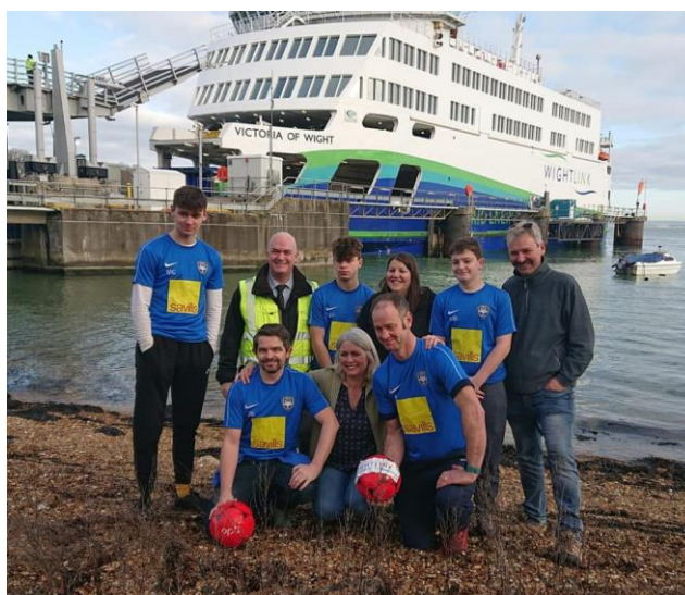
Figure 15: We're on our way! With special thanks to Wightlink, Isle of Wight Ferries & Savills Priory School

These visits are not a holiday. Each visitor has been allocated activities to support the work of the Centre. Also, these visits are physical demanding: most visitors suffered some health issues while in Kenya, with one supporter falling terribly ill with amoebic dysentery. She was treated very well at Buburi Clinic and recovered soon.