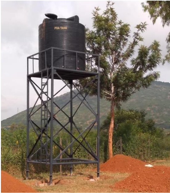
Figure 10: The new water tower

The water tower, the kitchen and the toilets, which we wrote about in our previous annual report, have been installed, thanks to generous donations of our supporters and hard work of the team in Kenya: