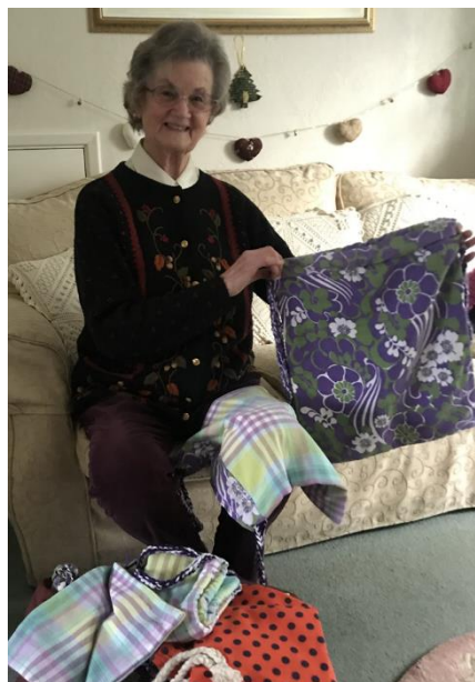
Figure 18: The Christmas elves have been busy: 340 drawstring bags...

All the children also received a drawstring bags for all the children with little goodies in it.