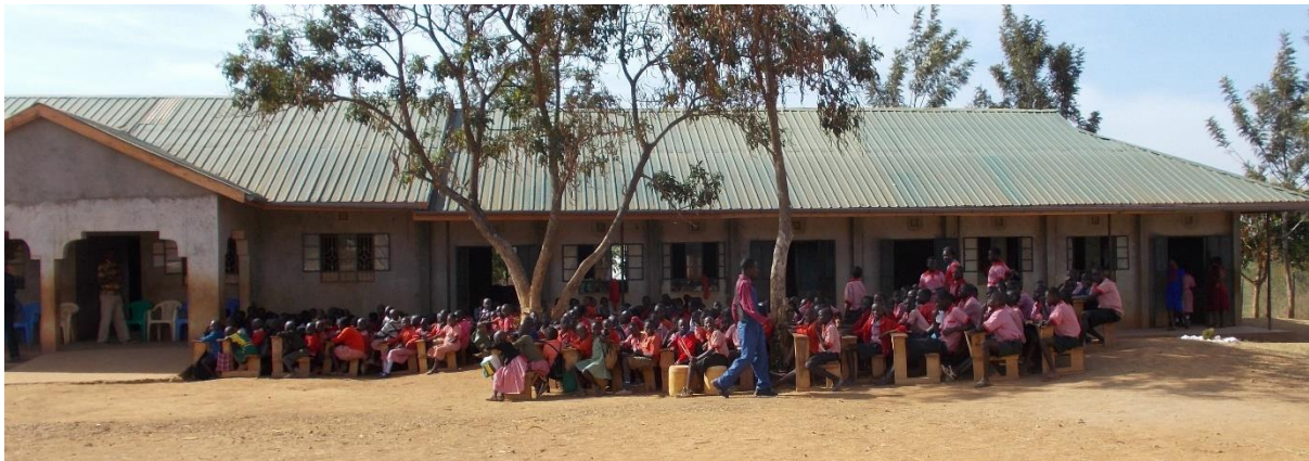
Figure 7: Desk sharing in practice

When the schools are re-opening in October, Uzima Children Orphan Centre will need to abide to a number of rules. Although the rules still can change, it is foreseen that this will include the use of thermometers and strict limits on the numbers of pupils per classroom. At Uzima Children Orphan Centre, a maximum of 20 pupils per classroom will be possible – with 10 rooms available, this means 200 pupils at a time, not the 340-attending school before the Covid crisis. Also, the school will need more desks, as children currently share desks.