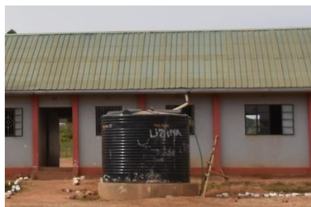
Figure 23: The existing Water harvesting tank

On top of the donations received from our supporters, Uzima In Our Hands received a grant from the Kitchen Table Trust (£6,000) which is used for the water harvesting project, which entails the installation of new pump + 3 water harvesting tanks. We will need to find an additional £3,000 to complete the project.