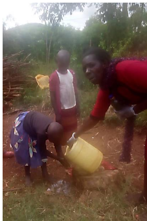
Figure 6: Newly delivered soap put to good use

Evans cannot distribute food as often as needed: each round of visits costs circa KSh 170,000 ( \approx £1,300). The current quarterly food budget of KSh 495,000 allows for one round per month. Given that the team not only feeds the children, but also their families, we think at least two rounds per month would be required.