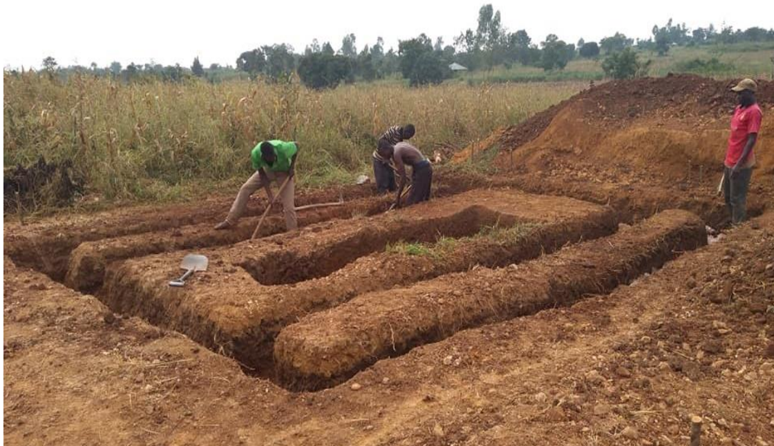
Figure 11: Toilets being constructed