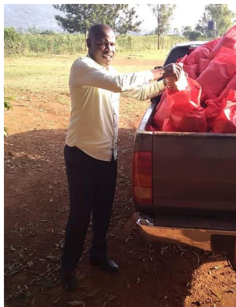
Figure :4 One of the local board members is a taxi driver, and he is delivering the food around the community by truck