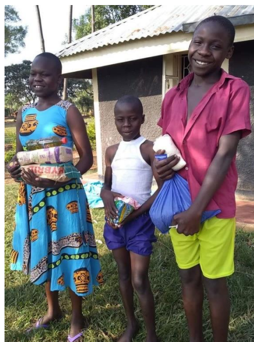
Figure 5: Happy faces when food is delivered

As you can imagine, these rules, as necessary as they are, have a real impact on Uzima Children Orphan Centre. As the centre is closed, the 340 children won't get their daily meals either. So the amazing team at Uzima Children Orphan Centre has redeployed themselves: