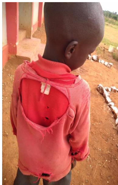
Figure 17: Replacement required...