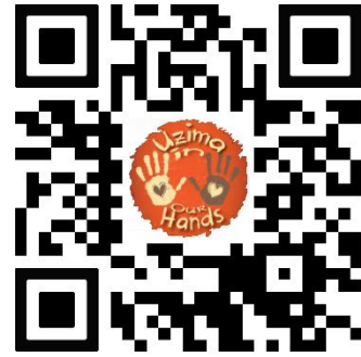
Figure 24: Website: www.uzimainourhands.org

Principal Address 12, Sunset Close, Freshwater, Isle of Wight, Postcode: PO40 9JR