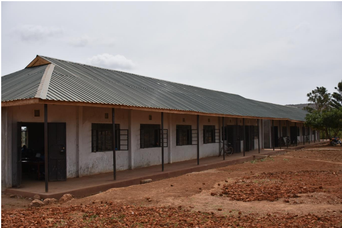
Figure 14: Vocational Classroom

Of course, the Covid crisis has put a big spanner in the works, as we might need the vocational classrooms as overflow for the primary classes.